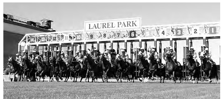
A full field breaks from the gate on September 8, 2005 for the first race on Laurel's newly renovated turf course.