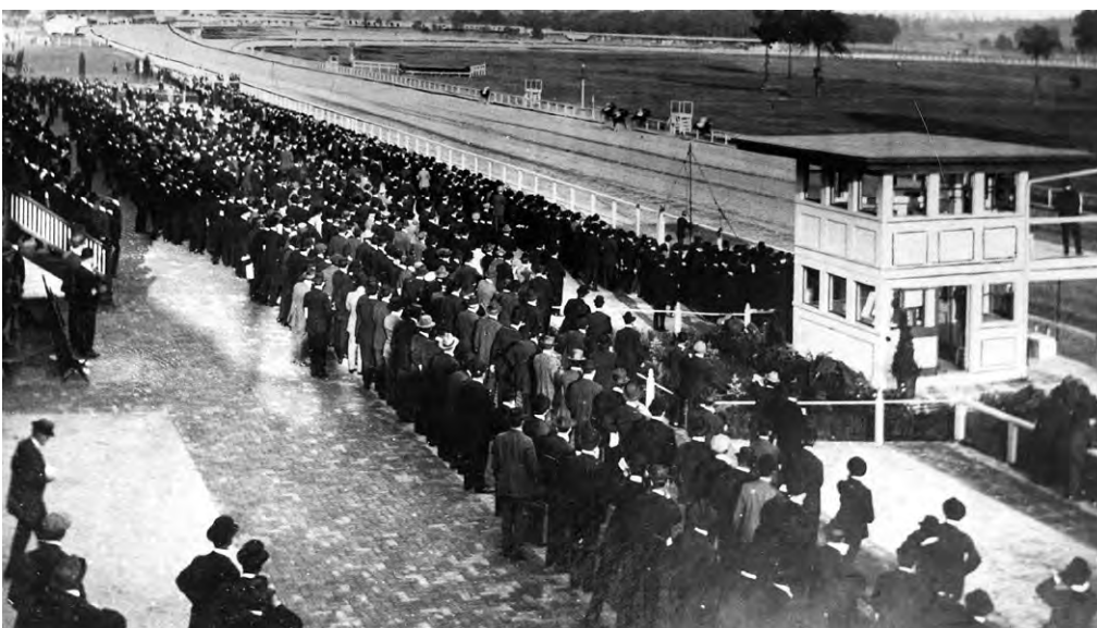
Laurel Park opened on October 2, 1911.