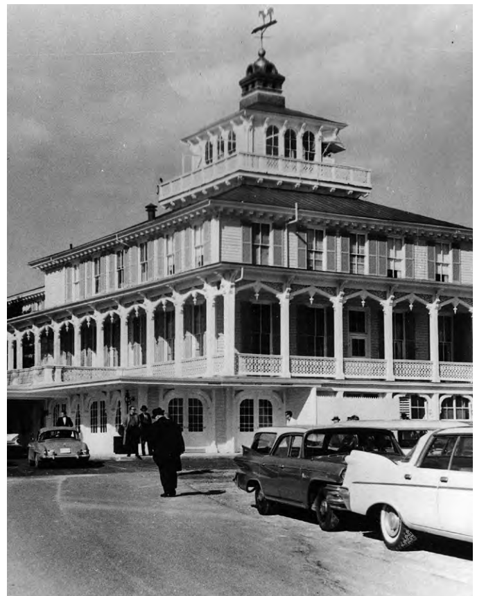
The Pimlico Members' Clubhouse circa 1959.